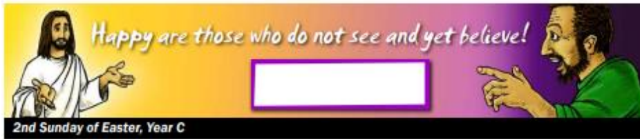
2nd Sunday of Easter, Year C